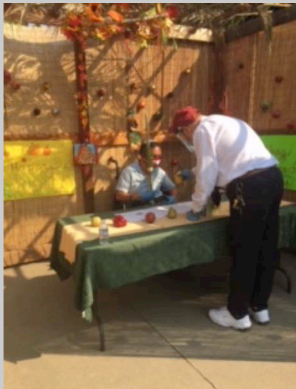
These were taken on October 4th in the temple patio during Sukkot. Care was taken to protect members from Covid-19.