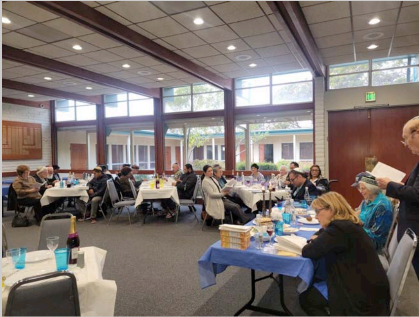
Community Passover Seder