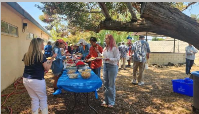
Getting food at the July 4 th picnic